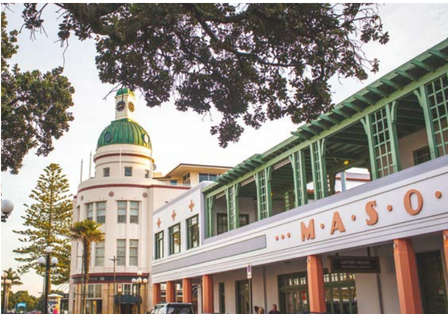
TOURISM NEW ZEALAND